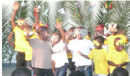
"The Lion sleeps Tonight"

After the play we said goodbye to seven of our children going to Grade 1.