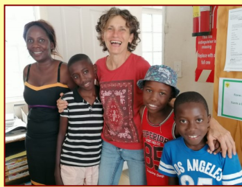
Visit by 3 alumni of 14 years old!